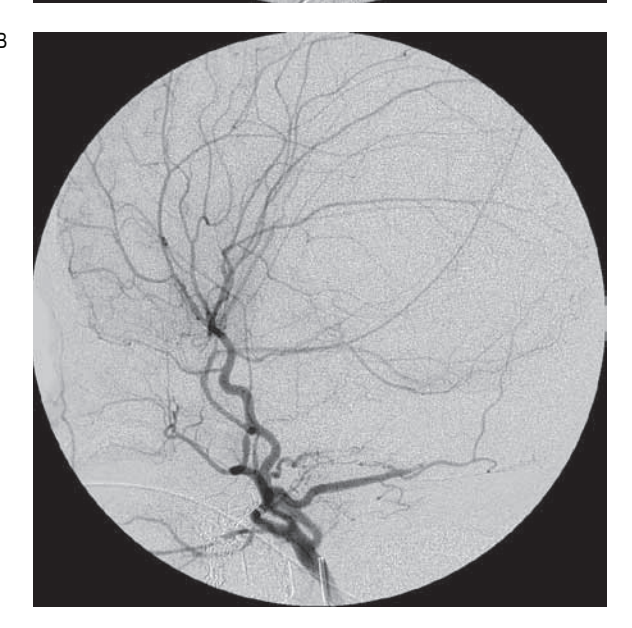
Figure 2 – Digital angiography. A) Pre-embolization angiography – dural direct arteriovenous fistula fed by a single enlarged left occipital artery and drained to the transverse sinus was found leading to an important enlargement of the bilateral transverse sinus including the torcula, with no signs of jugular bulb estenosis, pial reflux, or cavernous sinus abnormality. B) Post-embolization angiography showed complete resolution of the fistula.

DSM is a type of lesion in which the arteriovenous shunts are usually secondary and accessory to the sinus malformation. Infantile type of DAVS are often multifocal, with no sinus malformation, however present