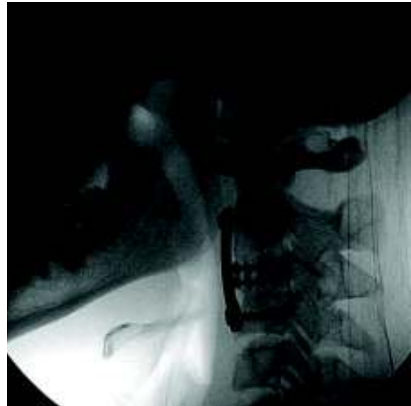
Figure 5 – Radiographic image presenting the anterior instrumentation of the cervical spine with C2-C4 fusion.