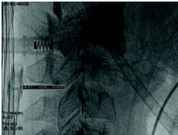
Figure 3 – Angiographic image showing stent implanted in the right vertebral artery, before the tumor resection.

and right vertebral artery levels, followed by anterior instrumentation of the cervical spine with bone plates and screws, performing cervical fusion of C2-C4. The radiographic image confirmed the proper placement of instruments in the cervical region (Figure 5). The patient was neurologically intact after surgery and his recovery progressed uneventfully. In 24 months of follow-up, the patient had no pain in the neck and normal movement of cervical region, without right motor deficit, absence of cervical spine instability and no recurrence of the tumor.