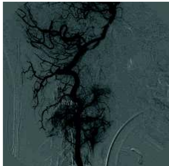
Figure 2 - Cerebral angiography revealed a vascularized lesion in the right cervical region and extraluminal compression of right vertebral artery. Observe the main feeding arteries tumor and the tumoral blush.